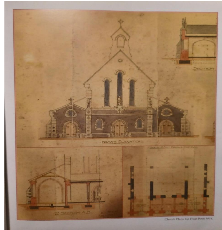
The original plans for the church